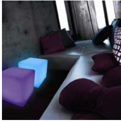
LED Cube – int./ext.