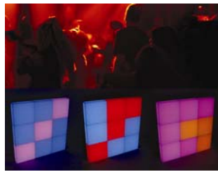
LED Pannel – sound motion