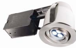
LED Recessed Fixture