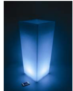
LED Flower pot – int. /ext.